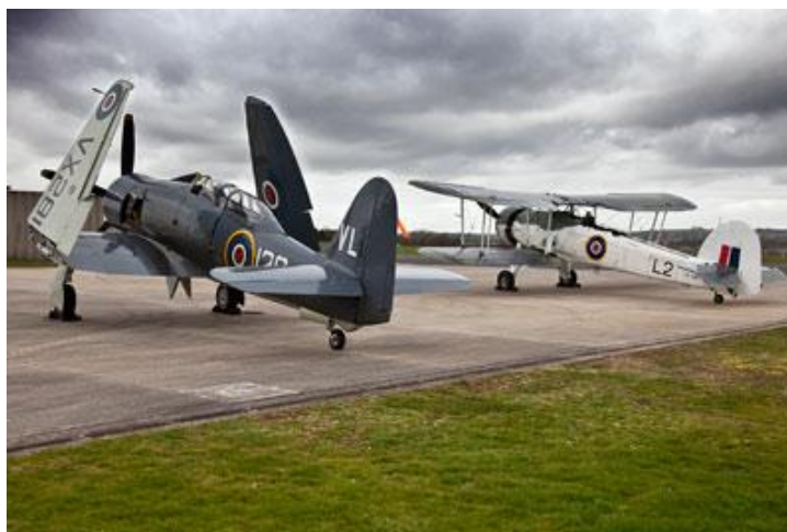
Newly-arrived Sea Fury T.20 VX281 with Swordfish LS326 immediately prior to flying for the RNAS Yeovilton Air Day Press Preview, 11 Marc 2011

The photograph shows both Swordfish LS326 and Sea Fury VX281 ready for Yeovilton's Air Day 2011 Press Launch. The Air Day is on the 9th of July this year and the RNHF Swordfish, T20 Sea Fury and Sea Hawk are scheduled to display on that day. Do come and see the aircraft, meet the pilots, engineers and the team behind the Fly Navy Heritage Trust who have the task of raising funds to ensure we keep these fabulous aircraft out and about at air shows for all to see.