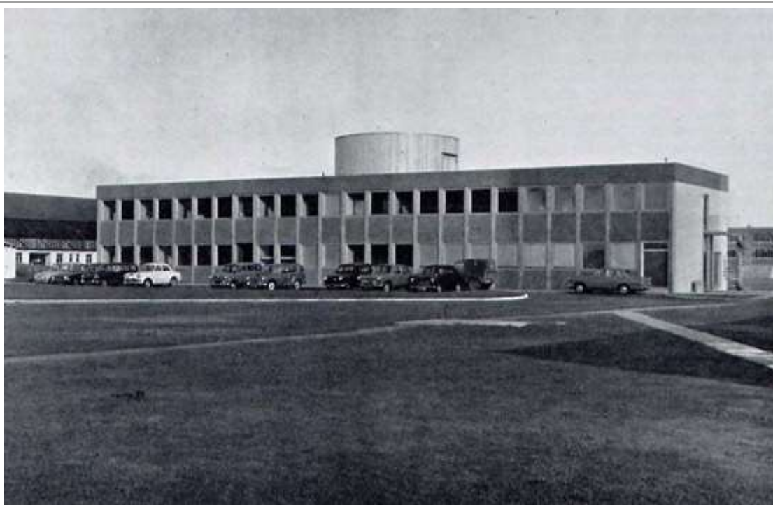
The Observer School, RNAS Lossiemouth

Also in 1966 the Observer School moved to Lossiemouth into new purpose built accommodation from its sunny stay in Malta and later it would move, yet again, this time back to RNAS Culdrose.