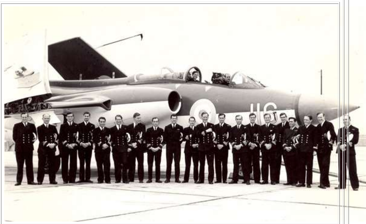
801 Naval Air Squadron on formation.