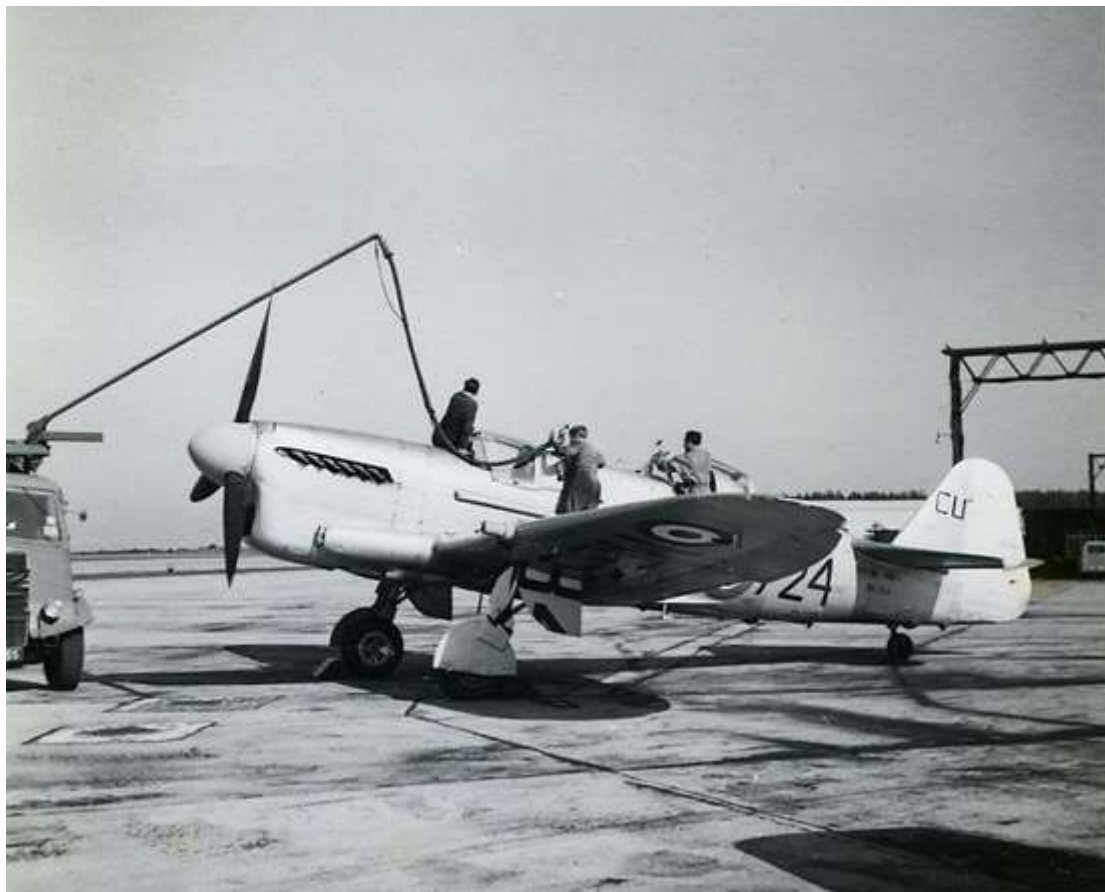
796 NAS Firefly from RNAS Culdrose refuelling at Lossiemouth 1955

This then was the situation as the Air Station moved into the 60s.